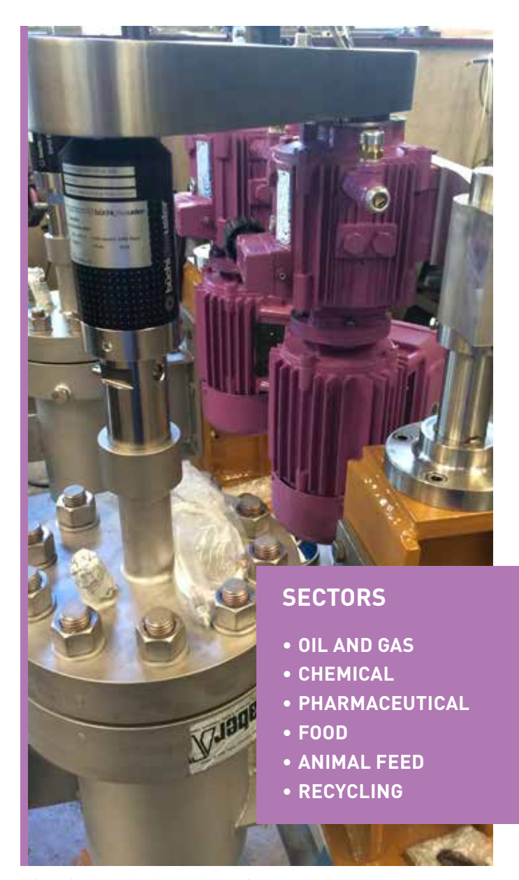
K2 variator on hydrocarbon mixer