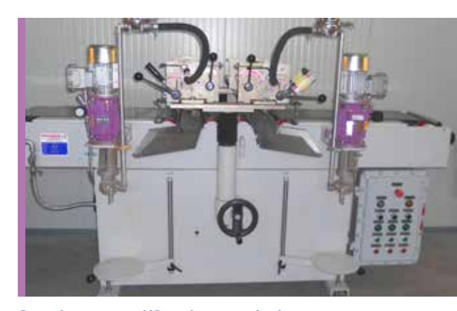
Curtain coaters: K2 variator on dosing pump