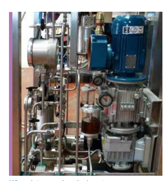
K2 variator on chemical sector pump