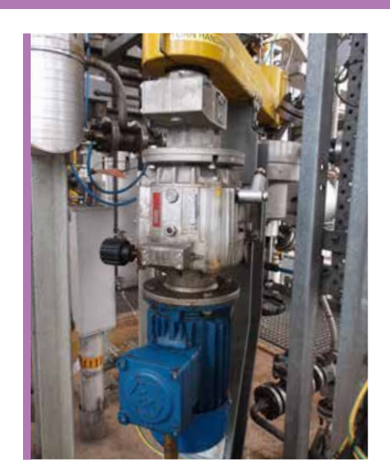
K4 variator on oil sector mixer